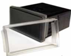
cover for UV-Monitor PRO11

Monitor Cover for Protection Level IP65 at Front